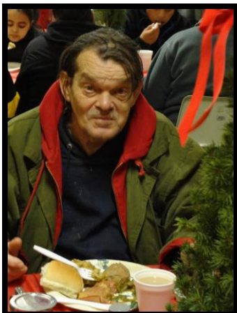
101,570 meals served

Basic needs provided to the hungry and homeless: