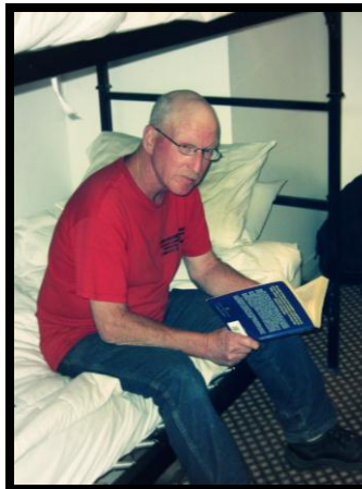
17,628 shelter beds