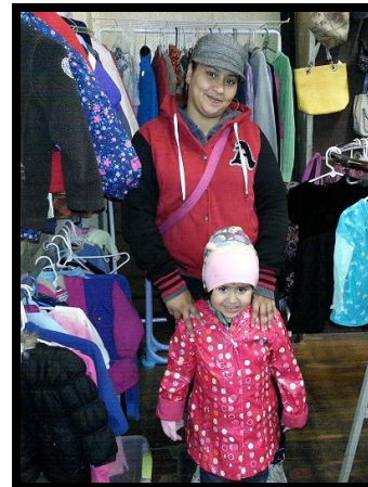
148,963 clothing items