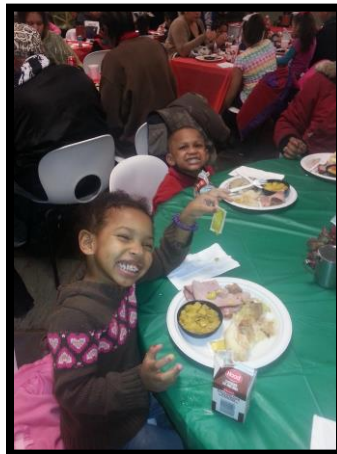
89,209 meals served

Basic needs provided to the hungry and homeless: meals, shelter beds, and clothing