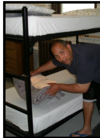
21,470 shelter beds